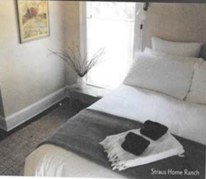
Straus Home Ranch